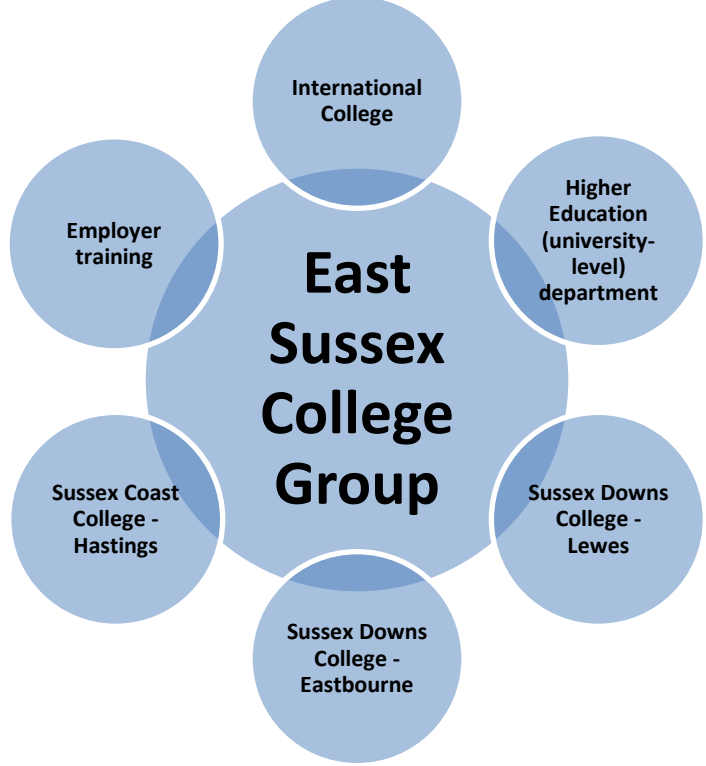
Figure 1: ESCG College divisions

Essentially, the College is made up of six distinct divisions: